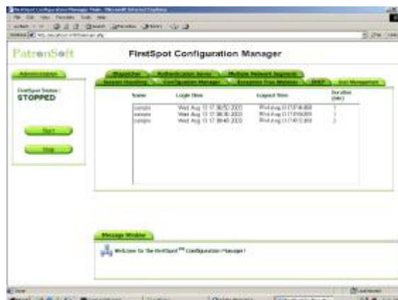
Fig. 2 All FirstSpot settings can be configured through the web-based Configuration Manager